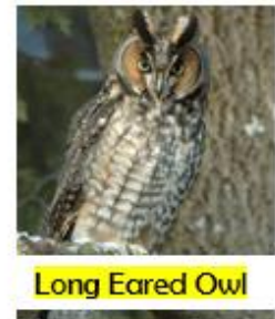
Long Eared Owl